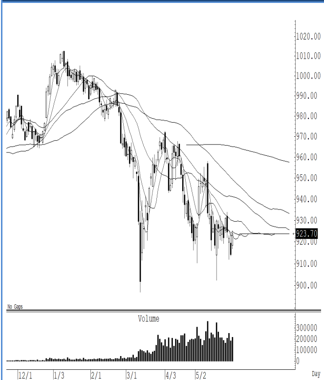
S50M23 (Close 923.70 Chg 9.50)